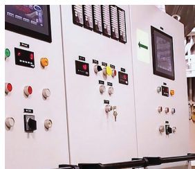
Electromechanical systems and components