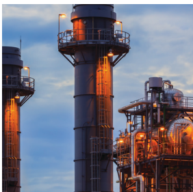
Energy and boiler plants

Regardless of your industry, we are always close to you and serve you in an individual and flexible manner. Our reliability also makes the risk management of your company easier; you get access to the right experts at the right time.