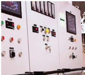
Electromechanical systems and components