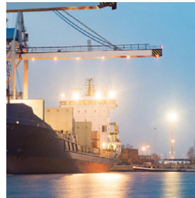
Cranes and load handling