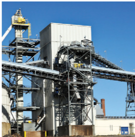
Material handling and conveyors